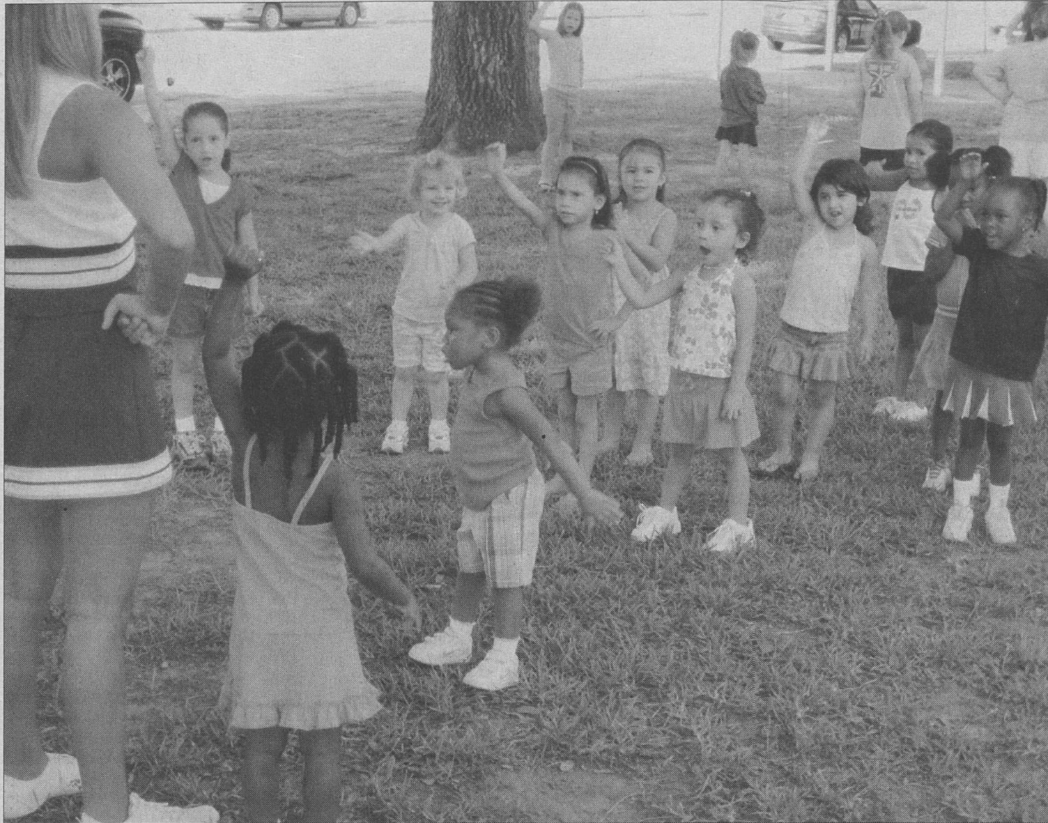
The Rice High School Cheerleaders hosted a cheerleading mini-camp last week. Pictured above are some of the participants showing off some new moves.